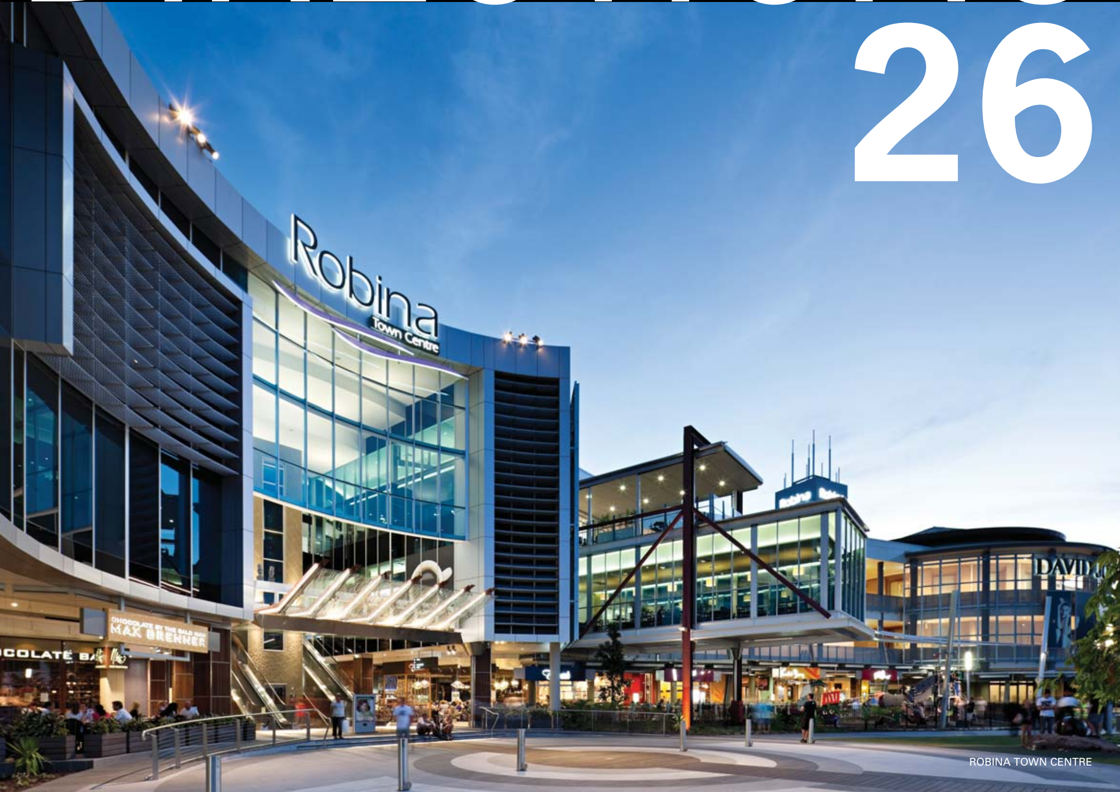
ROBINA TOWN CENTRE